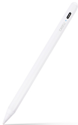
iPad Active Capacitive Stylus Pen