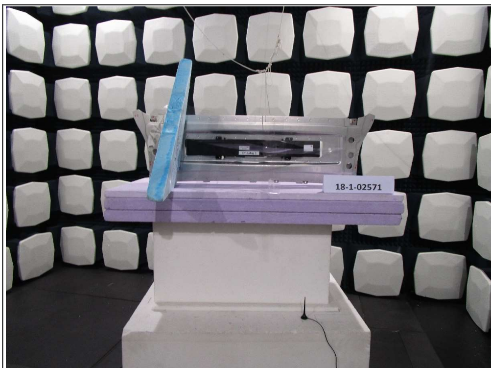
Photograph 2: setup view, EUT A, set-up 01 + op.01