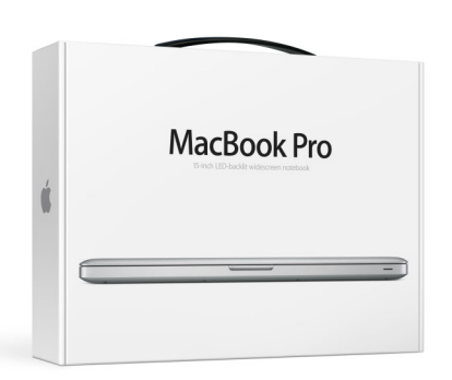
The 15-inch MacBook Pro retail packaging consumes 35 percent less volume than the original 15-inch MacBook Pro. Its retail and shipping packaging contain three times as much post-consumer recycled content as the original 15-inch MacBook Pro.

The 15-inch MacBook Pro features a breakthrough battery design that dramatically improves its lifespan—up to five years. So it uses just one battery in the same time a typical notebook uses three.