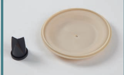
Diaphragm/Valve Kit (SDS061T)