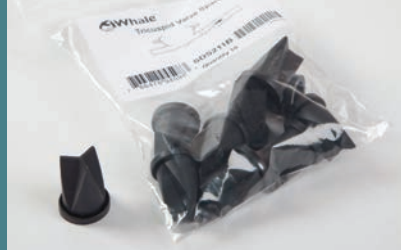
Tricuspid Valves X 10 (SDS211B)