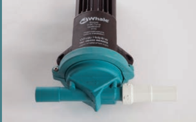
Shower Drain Pump (SDS021T)