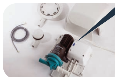
Sika Flow Sensor SDS263T