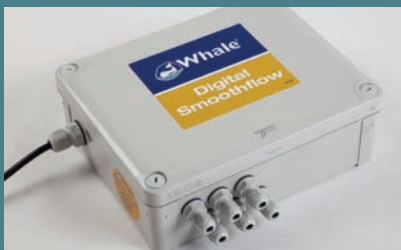
Digital Smoothflow Control Box (SDS243T)