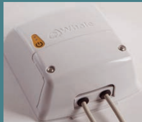
Instant Match transformer with wireless technology (SDS131T - 755.549)