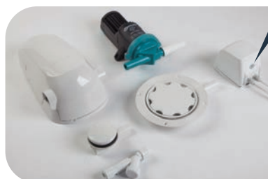
Wet Floor and Tray Gulley kit BP1578