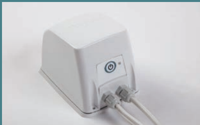
Switch Connect Transformer (SDS081T)