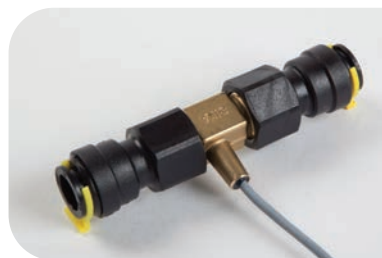
Sika Flow Sensor SDS263T