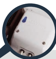
Whale Instant Match ® Kit SDP134T

Active Link Includes Active Link technology