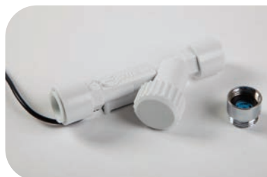
Mixer Valve Conversion Kit AK1570