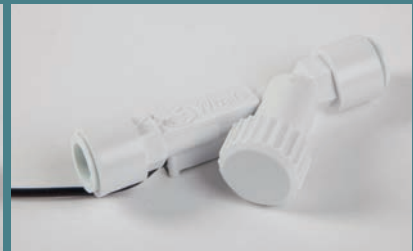
Flow Switch (AK1568)