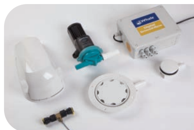
Digital Smoothflow Kit SDP113T