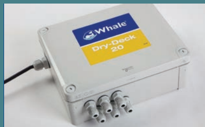
Dry-Deck Control Box (SDS273T)