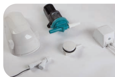
Tray Gulley kit BP1558B