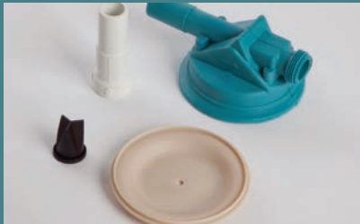
Spare Pump Head Kit (SDS071T)