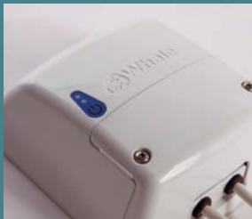
Instant Match Transformer with Bluetooth Technology (SDS236T)