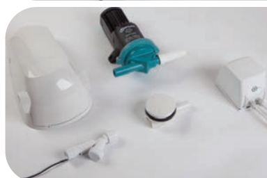
Tray Gulley kit BP1558B