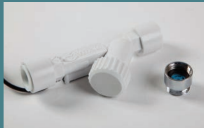
Mixer Valve Conversion Kit (AK1570)