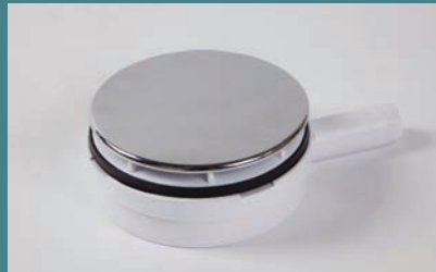
90mm Tray Gulley (AK1695)