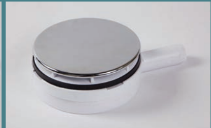
Marmox Tray Gulley (SDA001T)