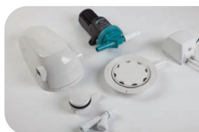
Wet Floor and Tray Gulley kit BP1578