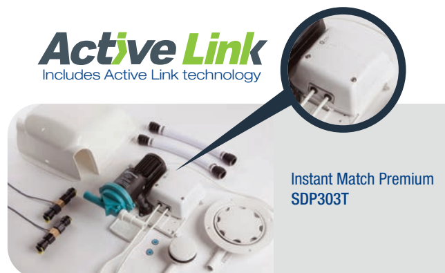
Instant Match Premium SDP303T

Active Link Includes Active Link technology