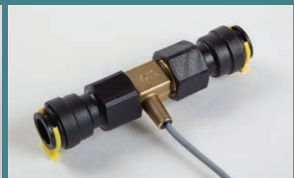
Sika Flow Sensor (SDS263T) (May also be used with the Instant Match and any electric shower)