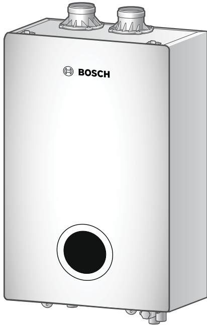
Bosch Singular 4000 Combi Boiler Bosch Singular 5200 Combi Boiler