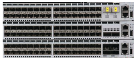
Figure 3: Arista 7280E Flexible Port Combinations

The 7280E delivers unprecedented levels of buffering, scale, and availability with high-density 10GbE interfaces and a choice of uplink interfaces as shown on the right from top to bottom: