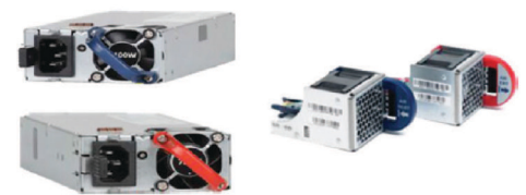
Figure 5: Hot swap and reversible power supply and fan modules