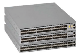
Figure 1: Arista 7280E family

With Arista EOS, advanced monitoring and automation capabilities such as Zero Touch Provisioning, VM Tracer, and Linux-based tools can be run natively on the switch with the powerful quad-core x86 CPU subsystem.