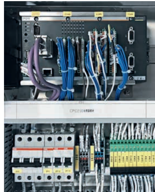
To control the vertical-axis turbine Tri-power New Energy relies on Bachmann's M1 automation system, developed with SolutionCenter engineering software

According to Prof. Cui, whilst vertical-axis system construction is far more straightforward compared to that of horizontal-axis turbines, some challenges still remain. Due to the system design, blades cannot be moved out of the wind during storms. Tri-Power New Energy therefore had to pay close attention to safety systems during development. "The design and control of the brake system in particular turned out to be challenging. But, together with Bachmann, we succeeded in designing a sophisticated system for this as well," the General Manager happily concludes.