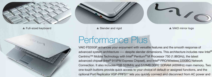
▲ Full-sized keyboard

* NVIDIA® TurboCache™ technology combines the size and bandwidth of video memory and dynamically available system memory for optimal system performance.