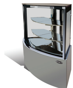
KBF-60C Refrigerated Corner Display Case