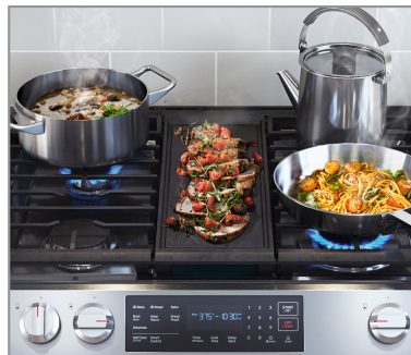
Powerful, Flexible Cooktop