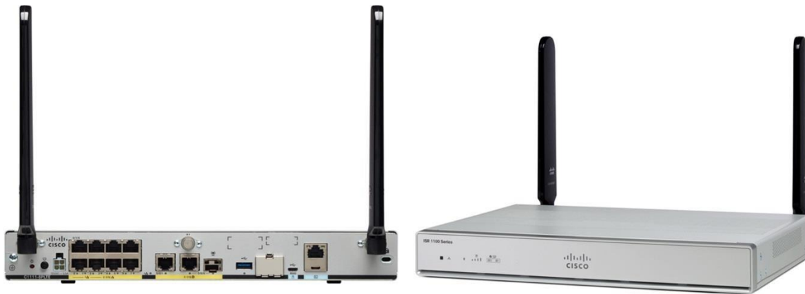
Figure 2. Cisco 1100-8P ISR with LTE advanced, back and front view