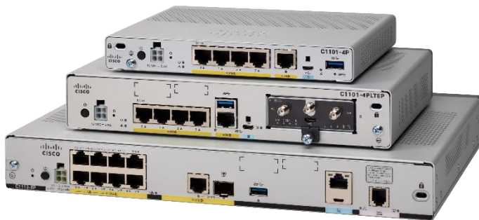
Figure 1. Cisco 1100 Product Family Series

Note: Not all 1000 series SKU variants are available in every region with different technologies (check on CCW pricelist for your region).