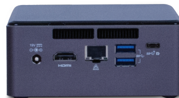
Back Ports Core i3

A: Call Howard Technology Solutions for world-class support and service, if there are any questions about this desktop. Customer support is available—online at http://www.howardcomputers.com/support , via email at tech@howardcomputers.com , by phone at 1.888.323.3151, or conventional mail at Howard Technology Solutions, 36 Howard Drive, Ellisville, Mississippi, 39437.