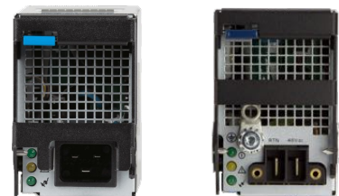
Arista 7300X Series Power Supplies

The AC power supplies are highly efficient in both platinum or titanium climate saver rated options and have an efficiency of over 93% with single stage conversion to the internal DC voltage. The DC power supplies require inputs at -48V DC to deliver up to 2700W. The 7300 Series uses multiple small power supplies which allows for incremental provisioning and smaller input circuits. Variable power supply fan speeds ensure power supply efficiency is optimized and reduces noise in data center environments.