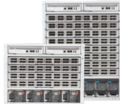
Arista 7300X Series Modular Data Center Switches

With reversible front-to-rear or rear-to-front airflow, redundant and hot swappable supervisor, power, fabric and cooling modules the system is purpose built for data centers. The 7300 Series is energy efficient with typical power consumption of under 3 watts per 10GbE port for a fully loaded chassis. All of these attributes make the Arista 7300 Series an ideal platform for building reliable, low latency, resilient and scalable data center networks. Combined with Arista EOS the 7300 Series delivers advanced features for big data, cloud, virtualized and traditional designs.