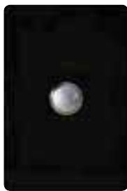
DIMPRKBS on a black switch plate (example)