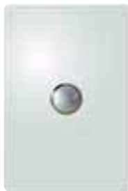
DIMPRKBS on glass-look switch plate (example)