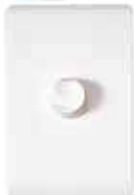
DIMPR knob on a white switch plate (example)

Set to your choice of green, blue or off.