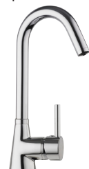
MES-G Gooseneck sink mixer