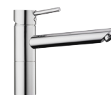
MES-A Straight spout sink mixer