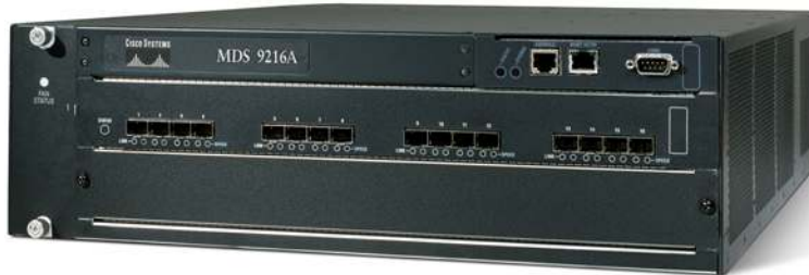
Figure 1. Cisco MDS 9216A Multilayer Fabric Switch

The Cisco MDS 9216A Multilayer Fabric Switch (Figure 1) brings new capability and investment protection to the fabric switch market. Sharing a consistent architecture with the Cisco MDS 9500 Series, the Cisco MDS 9216A combines multilayer intelligence with a modular chassis, making it an extremely capable and flexible fabric switch. Starting with 16 2-Gbps Fibre Channel ports, the expansion slot on the Cisco MDS 9216A allows for the addition of any current or future Cisco MDS 9000 Family module for up to 64 total ports.