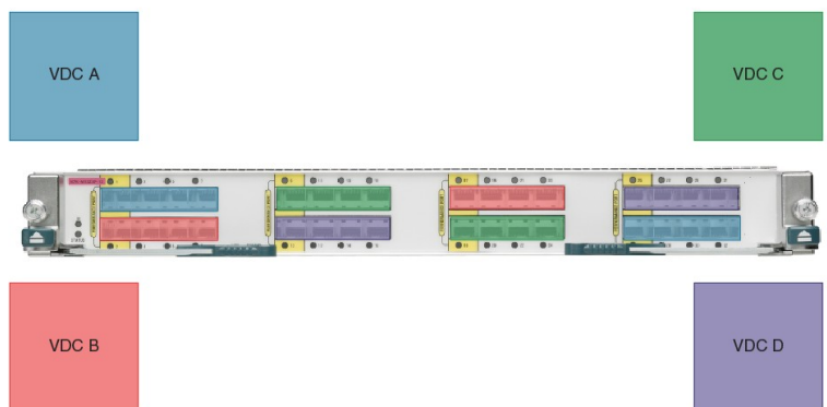
Figure 1: Example Interface Allocation for Port Groups on a Cisco 7000 Series 10-Gbps Ethernet Module (N7K-M132XP-12)

The table below shows the port numbering for the port groups.