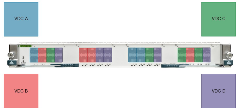
Figure 2: Example Interface Allocation for Port Groups on a Cisco 7000 Series 10-Gbps Ethernet Module (N7K-F132XP-15)

The table below shows the port numbering for the port groups.