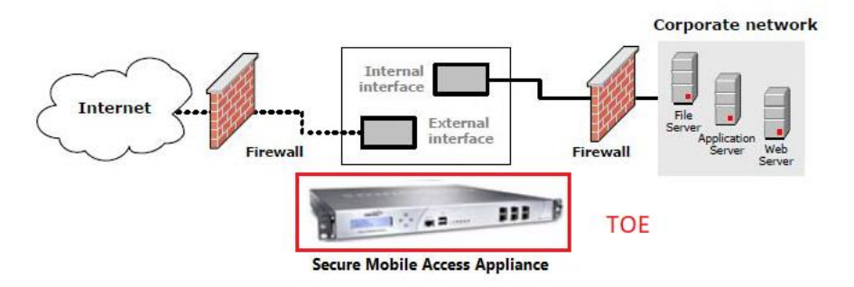
Figure 3: TOE Boundary and sample deployment