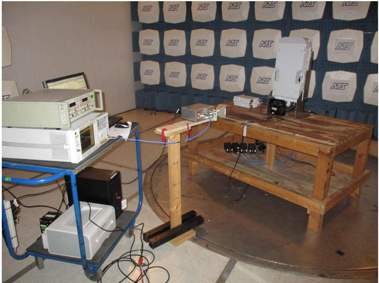
RE – 18-22GHz