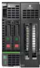
HP ProLiant WS460c Gen8 Graphics Server Blade