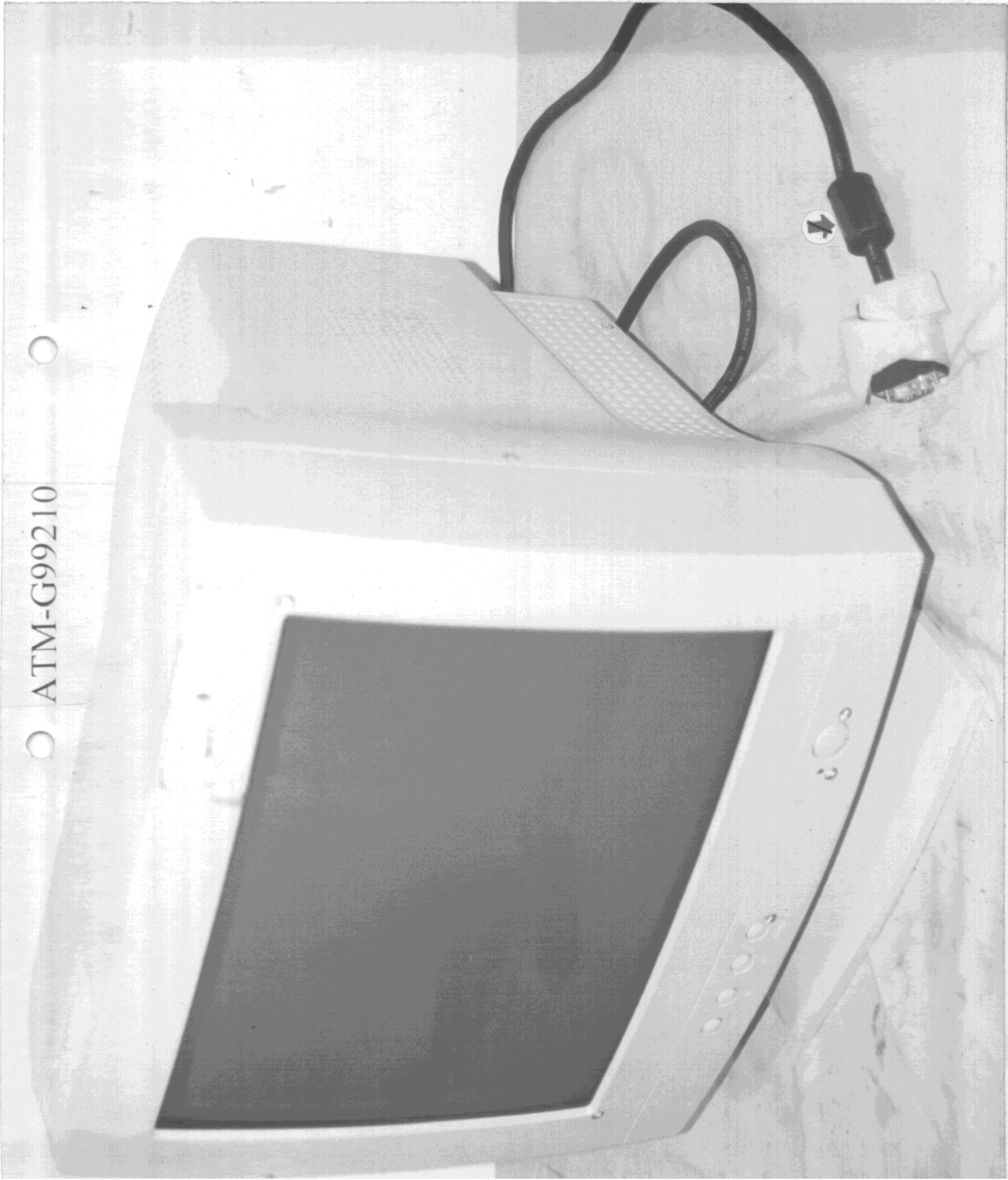
Figure 1 General Appearance (Front & Side View)