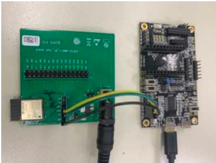
Figure 2: Hardware Connection