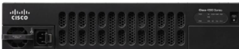
Figure 5. Cisco 4351

The Cisco 4351 is suggested for migration from existing Cisco 2951 routers. It offers 200-Mbps performance, upgradable to 400 Mbps, in a 2RU form factor with 3 NIM slots and 2 SM slots.