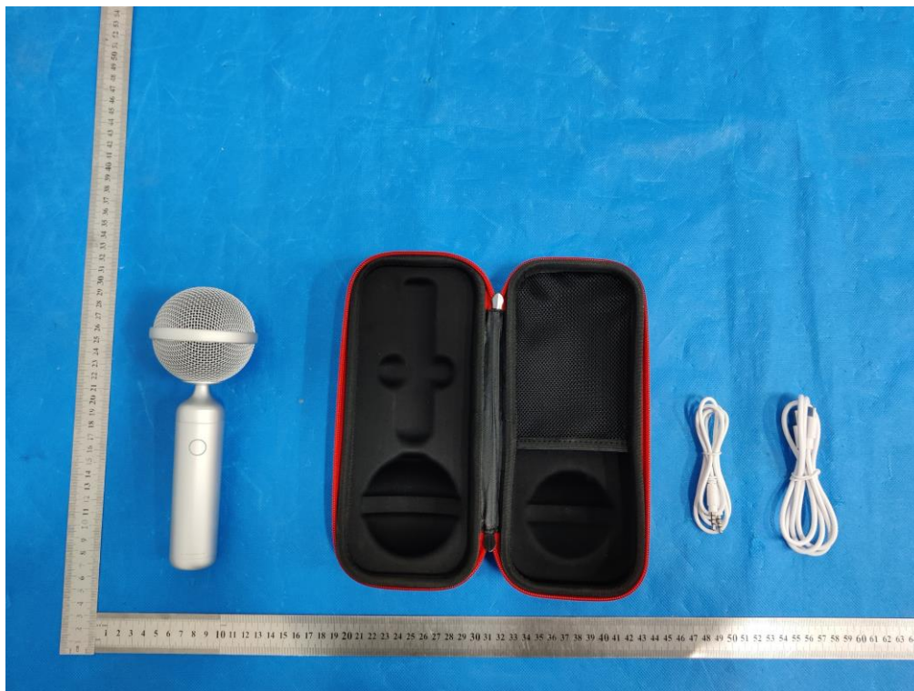
All VIEW OF EUT-2