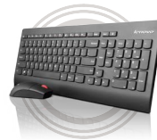
Lenovo™ Ultralim Wireless Keyboard and Mouse Combo