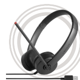
Lenovo™ Mono USB Headset