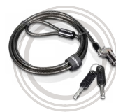
Lenovo™ Kensington® MicroSaver Security Lock